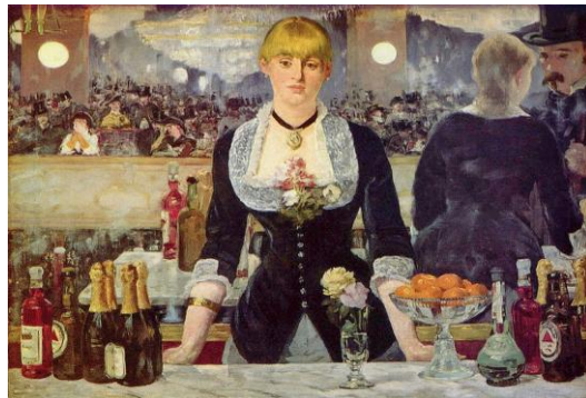
Edouard Manet, Bar in the Folies-Bergere , 1881-82

Wall's early works were informed by working class politics and art history, but lately his work seems to be more conditioned by the traditions of art photography.