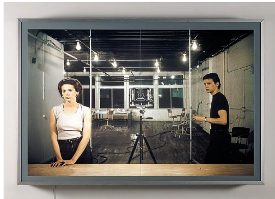
Jeff Wall, Picture for Women , 1979

While on vacation in Spain, what Wall would later describe as “a pretty darn good idea” came to him—he could import the grandeur of Western painting into the contemporary practice of photography. He could do so by essentially employing the techniques of modern moviemaking to create the work, then by employing a technique of modern advertising—the light box—to present it. It was an idea absolutely key to his success, soon placing him firmly within the tradition of great western art. And so a work like Picture for Women directly references A Bar at the Folies-Bergère by Édouard Manet (see below).